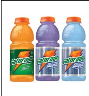
Is it a floor cleaner or a sports drink ?