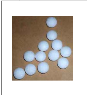
Marshmallows or Mothballs?