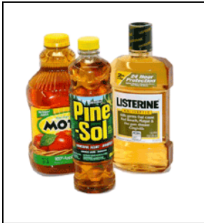
What is in the glass? Pine-Sol, Mouthwash or Juice ?